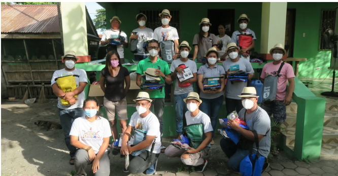
Turnover of JCI Makati donations for the Tamaraw Rangers in TCP