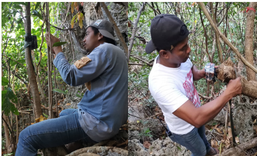
Camera trap setups for Ilin cloudrat survey in MIBNP and Magsaysay