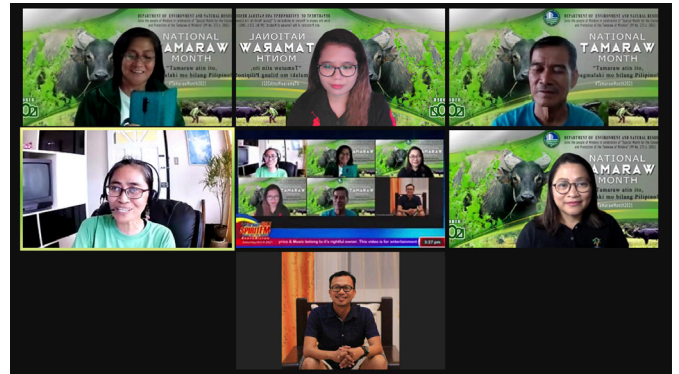
Radio guesting at SpiritFM for feature episode on Kali