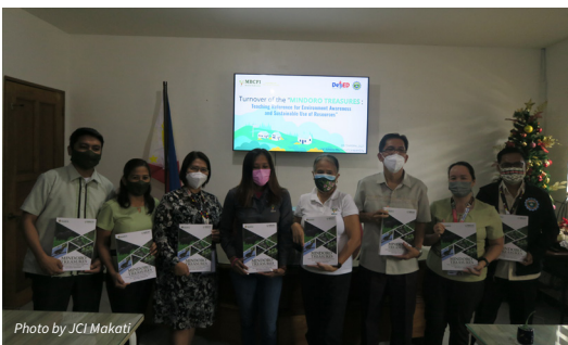
Turnover of Mindoro Treasures Sourcebook to DepEd Calapan City