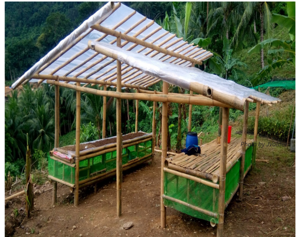
Established foodshed by MaSIPag members