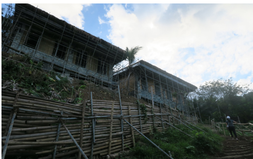
Current progress in MBCC construction site