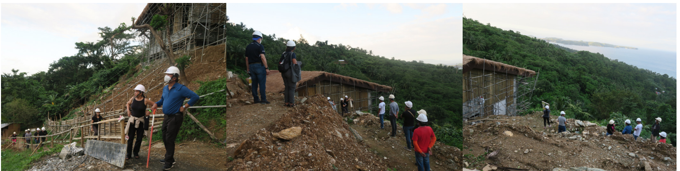
MBCC construction site visit