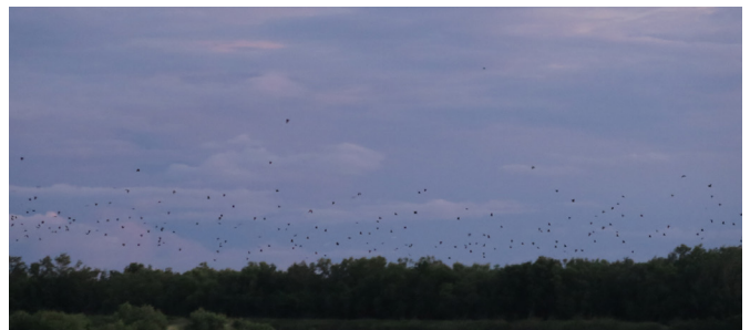
Flying foxes fly-out in Mangarin, San Jose