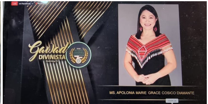
Gawad Divinista Award given to the Executive Director