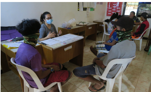
Post-perception survey in Barangay Bayanan