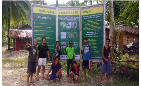
Updated billboards posted in Barangay Bayanan, Mt. Halcon