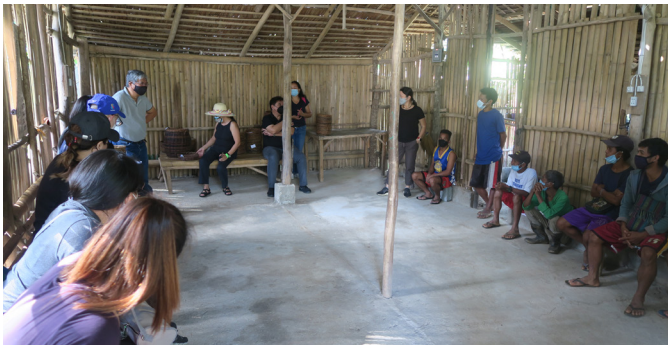
Community visit in Barangay Bayanan