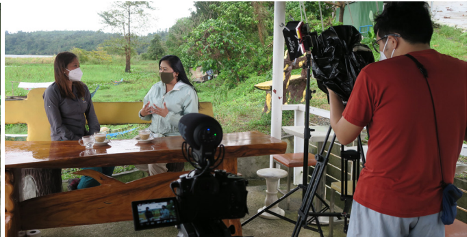
Film shoot with Channel News Asia for feature segment on Naujan Lake