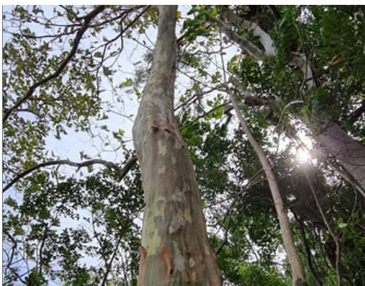
Tagged newly recorded teak in Magsaysay