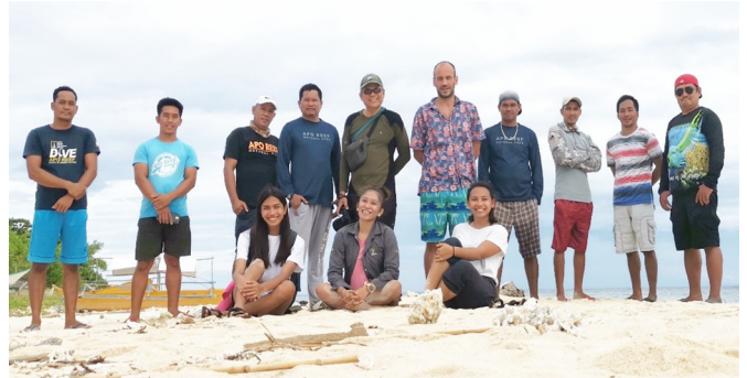
Survey team for Apo Reef waterbird census in November