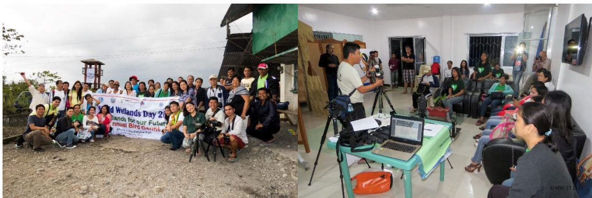
Figure 8. World Wetlands Day Celebration 2015 at Naujan Lake National Park.

World Wetlands Day 2015 (2 February 2015) at Naujan Lake National Park. MBCFI participated in celebrating the World Wetlands Day at Naujan Lake National Park organized by DENR and Protected Area Management Board of NLNP. The event included a launching of the Philippine Duck as the flagship species for the park in partnership with USAID-B+WISER as well as a photo exhibit at the CENRO-Socorro office and annual bird count at Brgy Malabo facilitated by MBCFI.