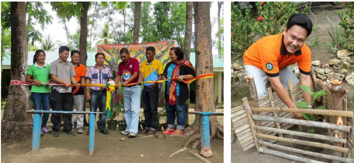
Figure 19. Ceremonial ribbon-cutting and planting of seedlings to launch the Philippine Teak as flagship species of Ilin and Ambulong Islands during the celebration of Environment Month.

Launching of Philippine Teak as flagship species of Ilin and Ambulong Islands and Celebration of Environment Month; June 5, 2015. The critically endangered Philippine Teak was launched as the flagship species in celebration of Environment Month. The event included lectures about Mindoro's biodiversity and MBCFI's conservation efforts not only on Ilin and Ambulong Islands but also throughout Mindoro. A ceremonial ribbon cutting and Phil. Teak planting culminated the event.