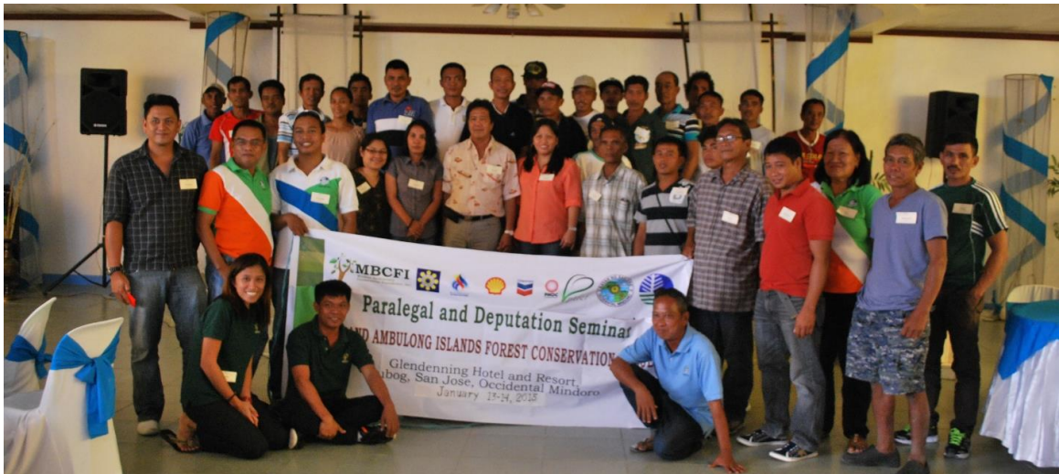
Figure 18. Participants from 11 barangays of Ilin and Ambulong Island during the Paralegal and Deputation Seminar.

Paralegal Seminar and Deputation; January 12-15, 2015. Part of the Ilin and Ambulong Forest Conservation Project is the formation of forest protection group or Bantay Kalikasan. It aims to encourage volunteerism among community members in protecting their own land or environment. And as part of the capacity building of Bantay Kalikasan members, Paralegal and Deputation Seminar was conducted which aims to provide general idea and knowledge regarding basic law enforcement concepts and procedures. The two days Paralegal and deputation seminar was facilitated by resource persons from DENR with assistance from MBCFI. The training focused on DAO 2008-22 S/DENRO and DENROS, Revocation and Termination of the deputation Order, Renewal of Deputation Orders for S/DENRO's, Legal Basis in Harvesting and Transporting Forest Products, DAO 97-32: Rules on the Administrative Adjudication of Illegal Forest Products, Machinery, Equipment, Tools and Conveyances, Paralegal Procedure on How to Conduct Surveillance, and Preparation of Filing Cases in Court and New Rules of Court on ENR Cases.