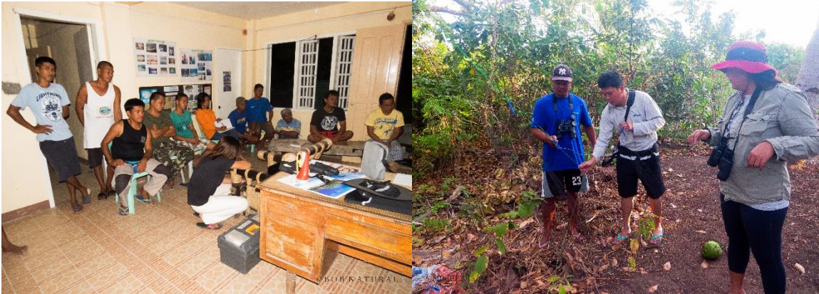
Figure 6. Terrestrial biodiversity monitoring methods lecture (left) and actual field survey (right) in ARNP.

the status of its terrestrial biodiversity. The survey also served as capacity-building activity for DENR personnel and the park's rangers enhancing the knowledge and skill on monitoring methods.