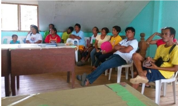
Figure 15. Community members of Brgy Harrison discuss formation of a peoples organization and applying for PACBRMA.

The project entitled “Multi-sectoral partnership combating forest fragmentation in MCWS” receives support from the Government of Germany through the GIZ-Protected Area Management Enhancement Project with the DENR. MBCFI has initiated a Conservation Needs Assessment in 23-26 March 2015 with major stakeholders and a series of coordination meetings including an Inception Meeting in 12 August 2015 which outlined major activities for the project as well as the roles and contribution of the involved stakeholders (Community organizations, DENR, PAMB, LGU, NCIP, PNP and Phil Army).