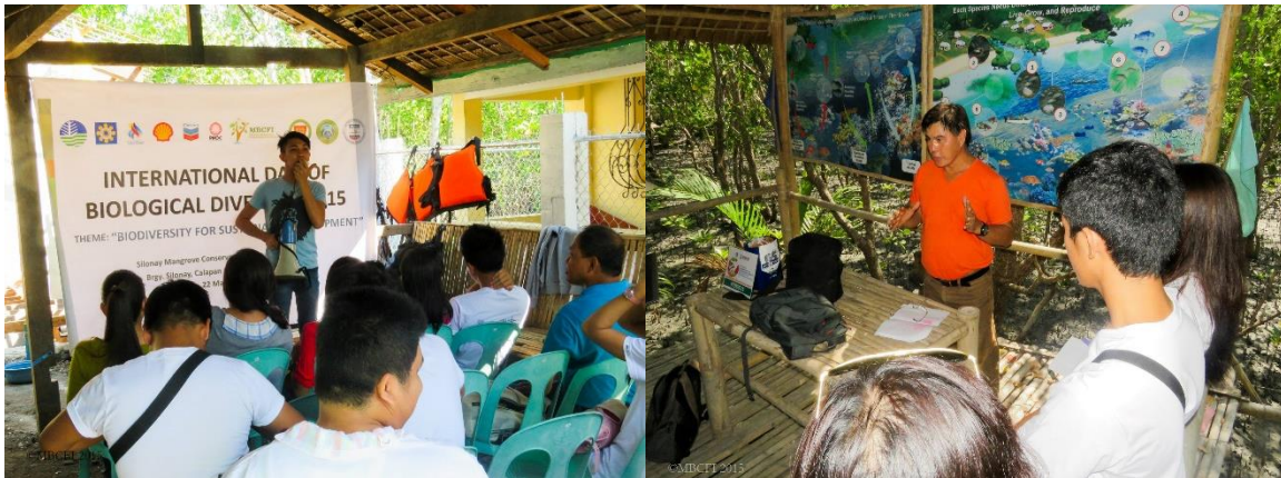
Figure 9. Celebrating the International Day for Biological Diversity at Silonay Mangrove Conservation Area, Calapan City.