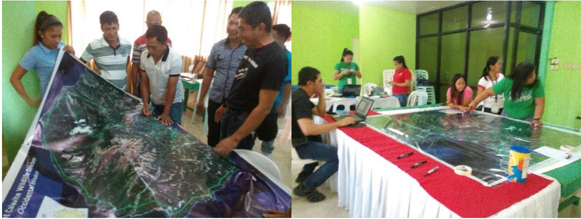
Figure 17. MBCFI staff facilitate Land-use mapping with Mt. Calavite Wildlife Sanctuary PAMB members and DENR technical staff.