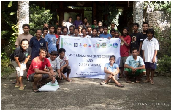
Figure 13. MBCFI organized a mountaineering guide training course with MFPI trainers for indigenous communities of Brgys Lantuyang and Bayanan.

sought to harmonize the three (3) existing guidelines. Round Table Discussions have been conducted with council members from barangay Lantuyang and Bayanan, the municipal environment and tourism offices of Baco and the Mt Halcon Technical Working Group to resolve the inconsistencies in the guidelines.