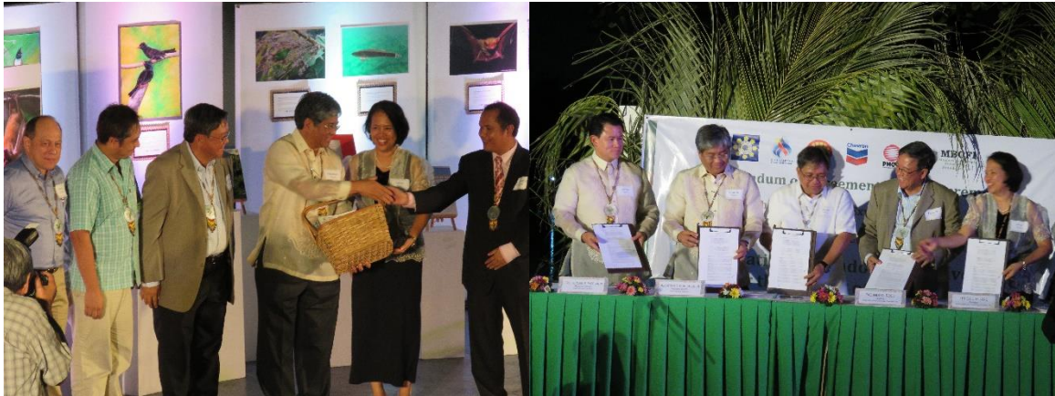
Figure 7. Launching of new species records in Mindoro and MOA signing ceremony between MBCFI and the Malampaya Joint Venture Partners.

World Wetlands Day 2015 (2 February 2015) at Naujan Lake National Park. MBCFI participated in celebrating the World Wetlands Day at Naujan Lake National Park organized by DENR and Protected Area Management Board of NLNP. The event included a launching of the Philippine Duck as the flagship species for the park in partnership with USAID-B+WISER as well as a photo exhibit at the CENRO-Socorro office and annual bird count at Brgy Malabo facilitated by MBCFI.