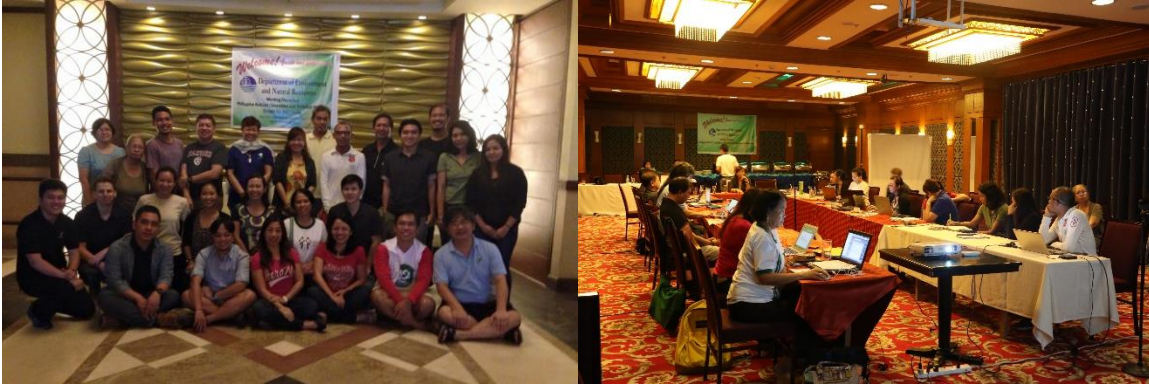
Figure 1. National threatened species assessment workshop participants with the Philippine Red List Committee heads.