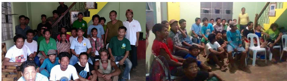
Figure 12. Indigenous community members volunteer as forest guards and develop their enforcement plan.

Thirty-six (36) individuals from the 3 peoples organizations volunteered as forest guards within their respective areas to support the park rangers of Mts Iglit-Baco National Park and Tamaraw Conservation Program in enforcing protected area regulations and national laws for wildlife environment protection. The volunteer forest guards have developed their own enforcement plan through the facilitation of MBCFI.