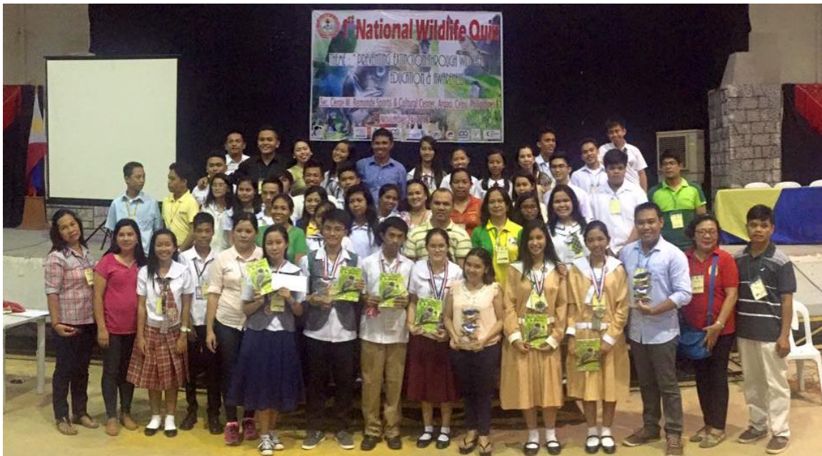
Figure 5. Participants to the first National Wildlife Quiz Bowl held at the Municipality of Argao, Cebu.

The foundation also sponsored 8 students from 4 schools in Mindoro as contestants for the First National Wildlife Quiz Bowl which was held in Argao Cebu last November 25, 2015. All 4 Mindoro teams were in the top 10: Holy Infant Academy of Calapan City garnered second place honors while San Teodoro National High School, Oriental Mindoro National High School and Puerto Galera National High School placed 5 th , 9 th and 10 th overall.