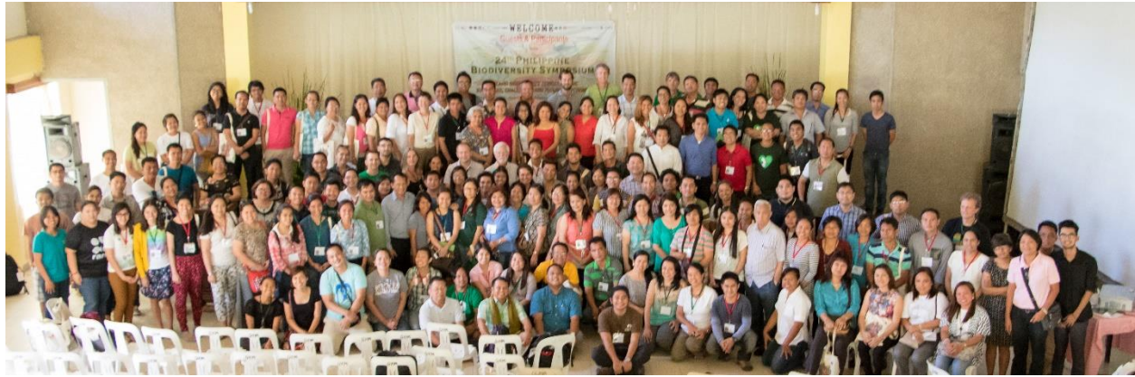
Figure 3. Participants of the 24th Annual Philippine Biodiversity Symposium at UEP-Catarman, Northern Samar.