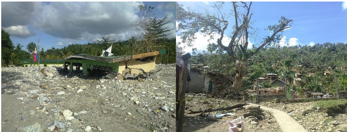
Figure 14. Indigenous communities in Brgy. Bayanan (left) and Brgy. Lantuyang (right) devastated by Typhoon Melor (Nona).

The recent typhoon Melor (Nona) which made landfall in the Philippines on 14 – 18 December 2015 has severely devastated the communities at the base of Mt Halcon on including those in Brgys Bayanan and Lantuyang. The field staff visited the sites immediately after the typhoon and coordinated with the local communities, LGU and MFI to initiate relief operations. MBCFI will be provided crop seeds to revive livelihood of affected families.