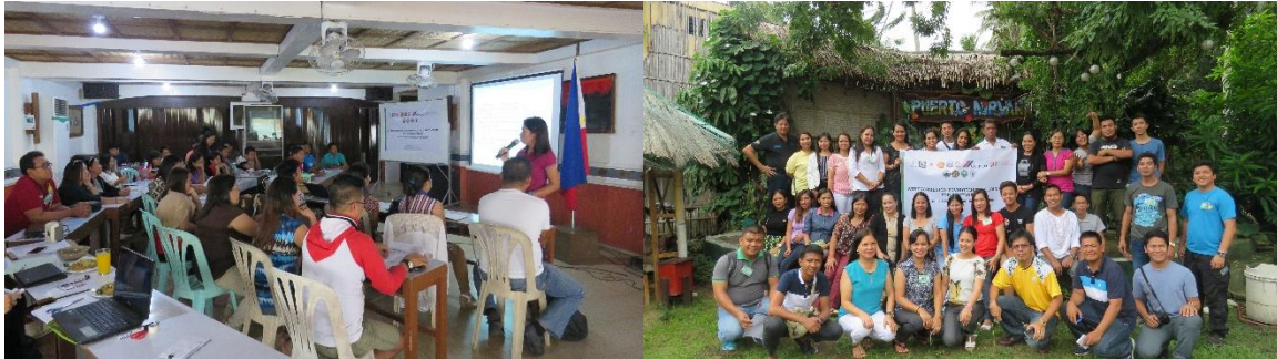
Figure 4. Biodiversity conservation training course for teachers at Puerto Nirvana Resort, Puerto Galera, Or. Mindoro.

Three batches of teachers' training were conducted this year on February 23-26, 2015 at Glendenning Hotel, Occidental Mindoro, October 22-24, 2015 and November 28-31, 2015 at Puerto Nirvana Resort, Puerto Galera. Thirty teachers were trained per batch with a total of 90 teachers trained in 2015.