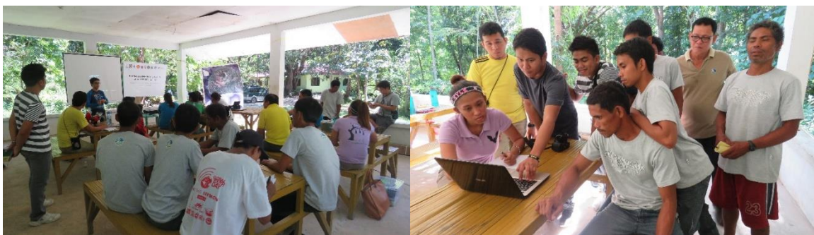
Figure 16. Members of Mt Calavite's green brigade and biodiversity monitoring team undergo BMS enhancement training by incorporating the SMART-LAWIN monitoring system.

A biodiversity monitoring system was installed initially through the formation and training of the monitoring team primarily composed of the bantay gubat (forest guards) on 30 June-1 July 2015. The monitoring sites consequently established in the following weeks after the training. The monitoring system and knowledge and skills of the team were enhanced by incorporating the Landscape and Wildlife Indicators (LAWIN) system developed by the Center for Conservation Initiatives – Philippines (CCI-PH) through a training course on 17-18 November 2015.