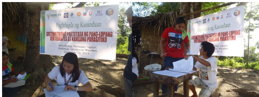
Figure 5. MOA signing with representatives of Tao Buid community and NCIP.

MBCFI and the Tao Buid Mangyans in Mt Siburan sign an agreement for the conduct of the biodiversity survey with the assistance of NCIP. The biodiversity survey was conducted with experts from Kansas University.