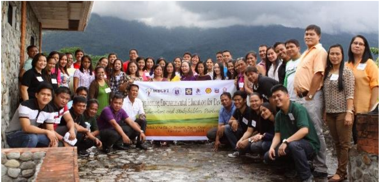
Figure 2. Participants, speakers and organizers of the biodiversity conservation training course for teachers at Dolce Vita Di Jo Resort, Baco, Oriental Mindoro.