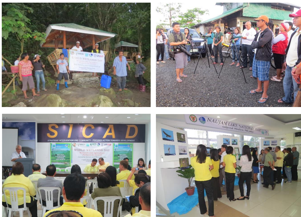
Figure 7. World Wetlands Day Celebration 2015 - Naujan Lake National Park: lake clean-up drive (top left) birdwatching with PAMB & LGU representatives (top right), biodiversity forum (bottom left) and photo exhibit (bottom right).

MBCFI participated in the celebration of the World Wetlands Day at Naujan Lake National Park organized by DENR and Protected Area Management Board of NLNP. Lake-shore events included simultaneous clean-ups by lake-side barangays led by their respective LGUs and birdwatching at Brgy Malabo. The celebration culminated in a biodiversity forum and a week-long photo exhibit at the provincial capitol. The forum and exhibit was opened by provincial governor Alfonso V. Umali.