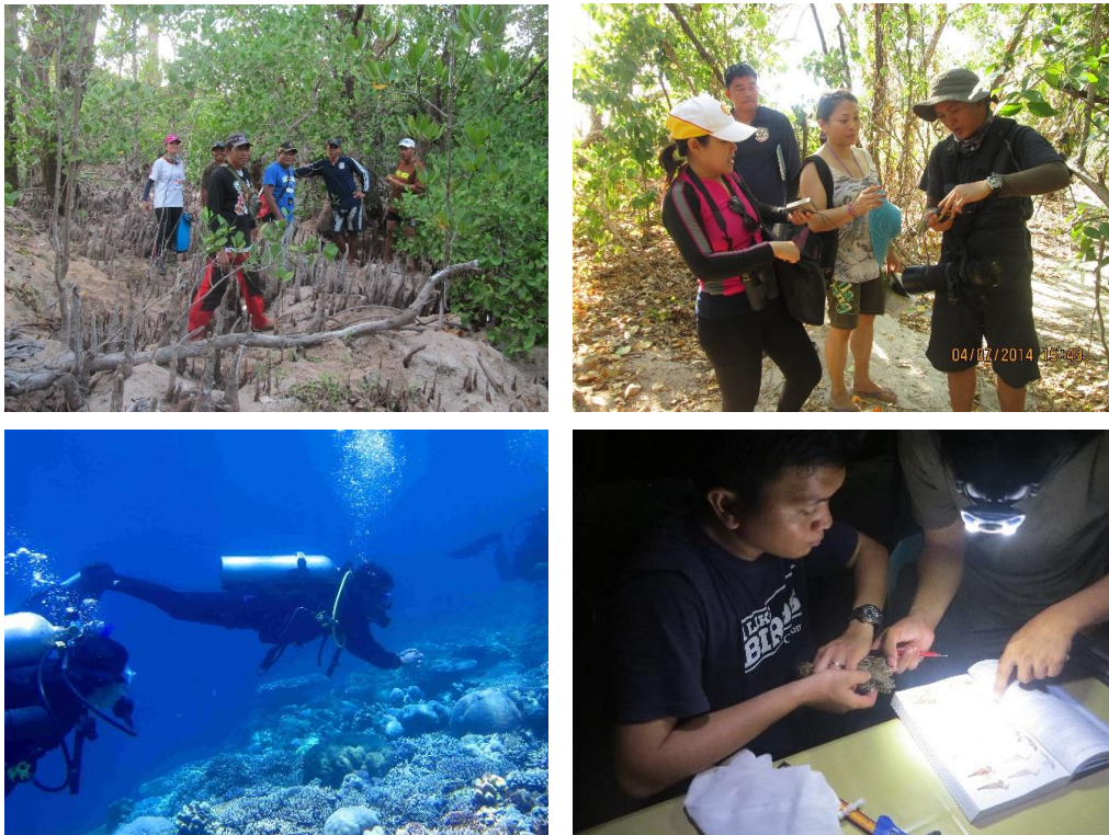
Figure 4. Biodiversity field survey – terrestrial flora (top left), terrestrial fauna (top right, bottom right) and marine (bottom left) teams at ARNP.

A biological survey was conducted at ARNP on 6 – 11 April 2014 to monitor the status of its terrestrial and marine biodiversity. Simultaneously a series of workshops and community discussions were conducted to assess the socio-economic conditions in coastal communities of the municipality of Sablayan. The surveys were conducted to provide up-to-date information for the development of ARNP's Ecotourism Development & Business Plan. It also served as venue to conduct capacity-building activity for DENR personnel and the park's rangers enhancing the knowledge and skill on monitoring methods.