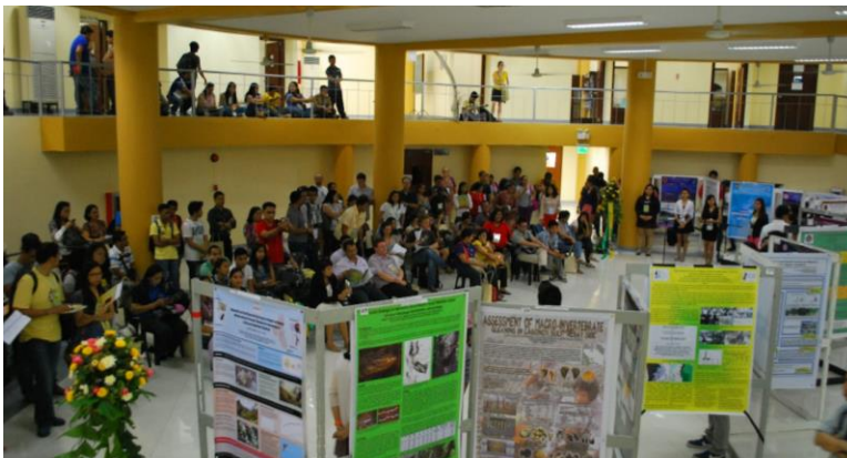
Figure 8. Poster presentations during the 23rd Annual Philippine Biodiversity Symposium at University of San Carlos – Talamban Campus, Cebu City.