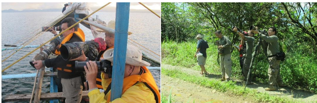
Figure 6. Wildlife Photosafari with WBPP members at Naujan Lake and surrounding watershed forests.

MBCFI invited members of the Wild Bird Photographers of the Philippines (WBPP) to visit Naujan Lake National Park (NLNP) to take photos of wildlife in their natural habitat. The activity was organized to generate wildlife and natural landscape images of Mindoro for awareness raising activities of MBCFI and its partners. Photographs taken during the photosafari were immediately processed and put on an exhibit during the World Wetlands Day celebration at the provincial capitol.